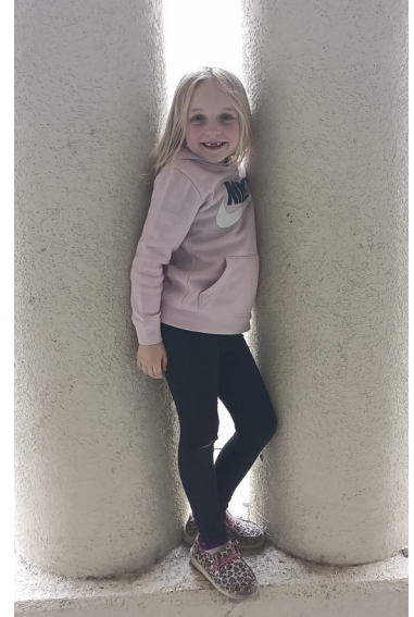
Kinsleigh | Kindergarten