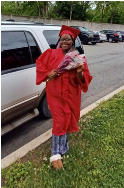
Dakota | High School