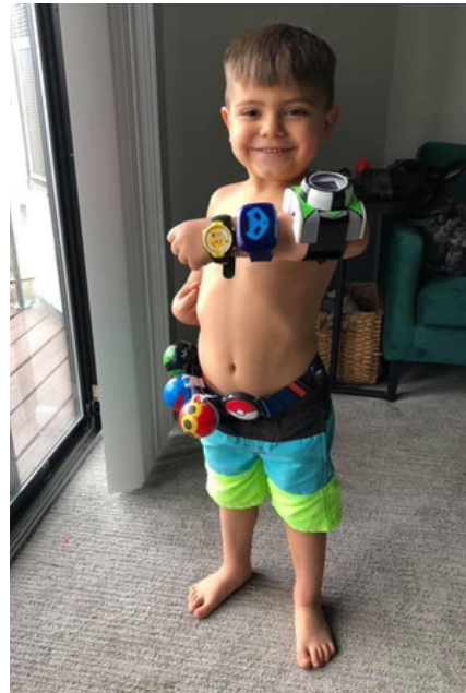
Banner | Kindergarten