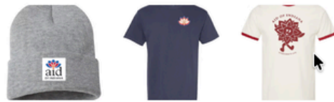
AID 12" Solid Cuffed Beanie EMBROIDERED $25.00 Add to Cart