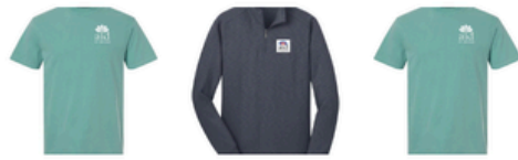
AID Youth Heavyweight Ring Spin Tee $25.50 Add to Cart