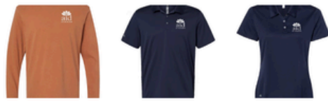
AID Unisex Garment-Dyed Heavyweight Long Sleeve T-Shirt $35.50 Add to Cart